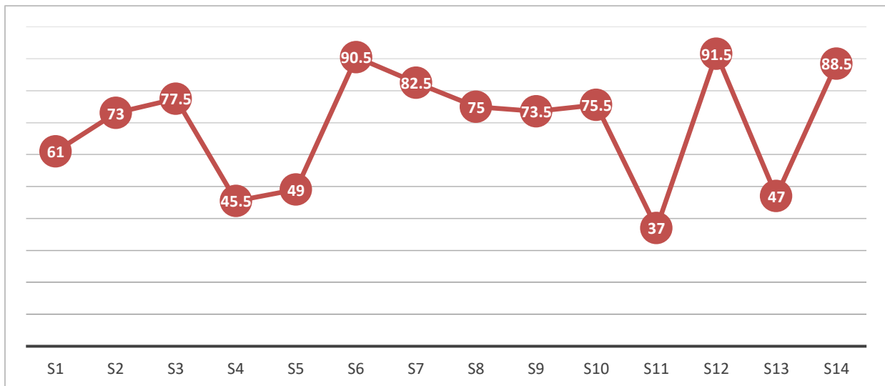
Graph 2. The Students' Achievement